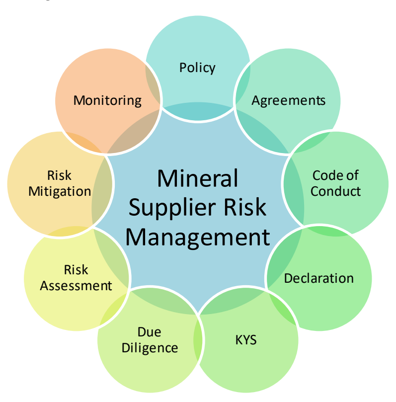
Figure 2. Supplier Risk Management

Engagement with suppliers to assess and improve their due diligence performance is conducted regularly. In 2024, Sherritt engaged with Moa Nickel, its own JV mine and largest supplier, to develop a CAHRA methodology. Engagement also includes regular calls and meetings with third-party suppliers to review and discuss Sherritt's Responsible Production and Supply Policy and Supplier Code of Conduct requirements as well as KYS questionnaires and supplier declarations. This is further described below in the section on KYS activities. Sherritt's approach to mineral feed supplier risk management is represented in Figure 2.